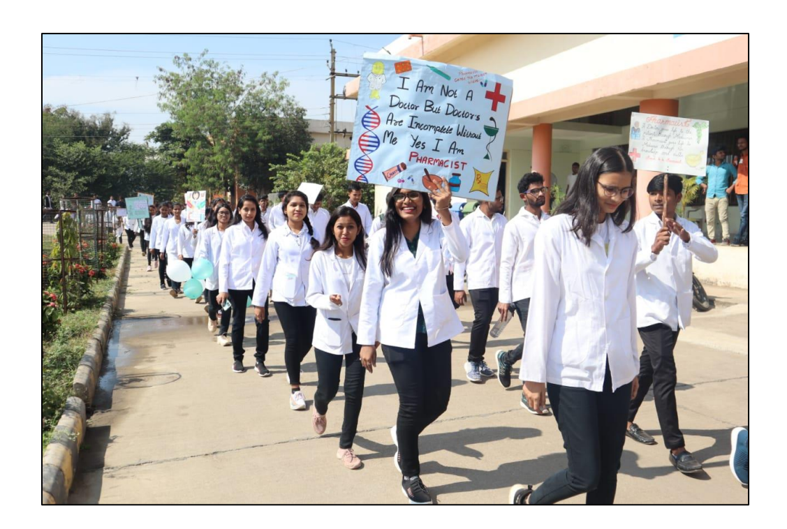
Image 3: Pharmacists awareness rally moving through various departments and sensitizing stakeholders